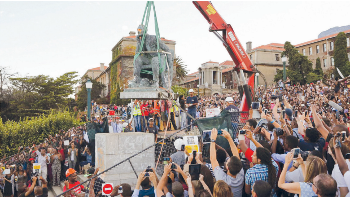
Rhodes must fall

Alongside this utopic modelling of potential futures are the equally resonant issues of grappling with a city's contested past. It is worth remembering that Jeremy Deller's soldier performers disruption of the temporal limits of public space in Bristol last year also occurred in a centre promenade in Bristol overlooked by a statue of slave-owner Edward Colston – a site of consistent and increasingly urgent debate in a city built on the slave trade. Historian David Olusoga explores the implications of public monuments as sites of contested histories through the protest movement for the removal of the Cecil Rhodes statue at the University of Cape Town and the subsequent violent rallies which erupted around the confederate statue in Charlottesville this August.